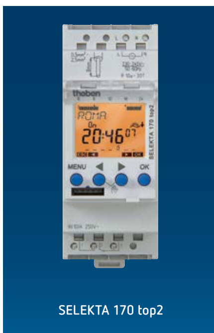
SELEKTA 170 top2

When the peace bell begins to swing on the Colle di Miravalle in Roverto and the heavy clapper teases out the first note from the bronze casting, the spectators can look forward to an impressive experience: A powerful peal of bells rings out in the evening sun against an impressive mountain backdrop. And once the hundredth ringing of the bell fades away, spontaneous applause breaks out. With its 3.21 metre diameter, 3.36 height and 23.2 tonne weight, the bell may well be one of the biggest of its type in the world. Perhaps that also applies to the priest Don Antonio Rossaro, who, in 1924 just a few years after the terrible battles in the region had the idea of casting a memorial bell out of cannons from the all countries involved in the First World War.